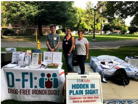
Hidden in Plain Sight Display from Summer Movie Event July 2018

Our focus in 2019-2020 will be to expand current work with the Hidden in Plain Sight Display and move towards more information about talking with your child early on about substance use. We will be focusing on early use of nicotine and marijuana, often though not exclusively through “electronic nicotine delivery systems” (ENDS). Media campaigns targeted to youth (12-18 year olds) to increase perception of risk and harm as well as a media campaign for parents to help educate, inform and enhance skills will be created for both nicotine and marijuana. In addition, the coalition will be supporting policies and advocating for increasing the age to 21 for youth to obtain nicotine products (including delivery systems).