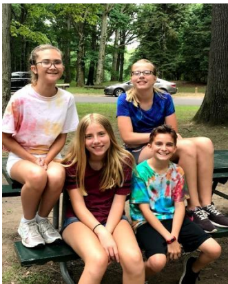
Youth Hike with ROcovery Fitness in Durand Eastman Park-August 2018

Irondequoit Police Department also distributed Talk, They Hear You tent cards on behalf of DFI: Together to some of our area restaurants to help parents key into some tips on how to talk to your child about alcohol and other substances.