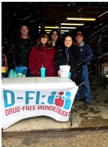
DEA Drug Take Back Day-April 2019

June-Annual Community Evening meeting-June 10 (Wednesday) 6:30-8:00 PM