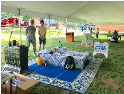
National Night Out-Hidden in Plain Sight Display-August 2018

A website has been created to provide information and educational materials. These can be found at www.dfitogether.org